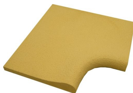
BSCR15—Bordadura Stipple Canto R15 52x34x3cm