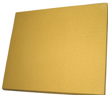
PS60— Placa Stipple 60— 60x60x2.5cm