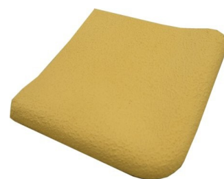
BSA—Bordadura Stipple Ângulo (D/E)