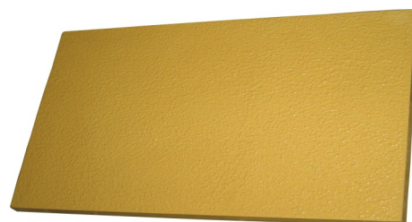
PS40—Placa Stipple 40—60x40x2.5cm