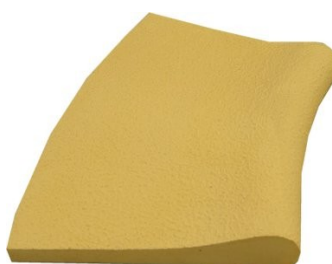
BSC/R—Bord. Stipple Curva R610/R730/R986/R1365