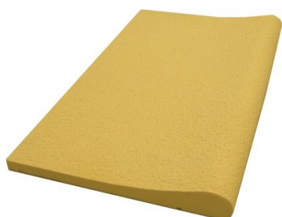
BSD— Bordadura Stipple Direita 60x34x3cm